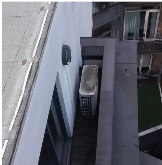
Image 5: Photograph from roof of Zinc House showing existing heat pump at Balcony Level.