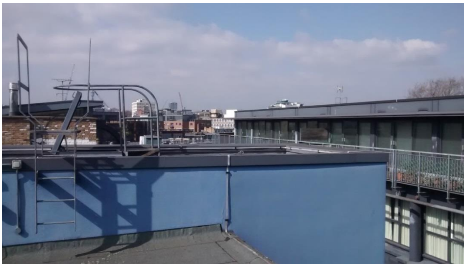
Image 2: Photograph from roof of Zinc House showing relationship to City Pavillion