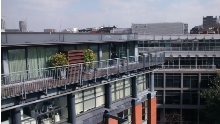
Image 3: Photograph from roof of Zinc House showing relationship to City Pavilion